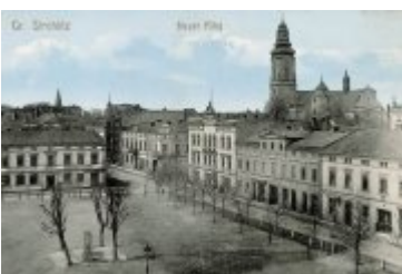
• Stare zdjęcia