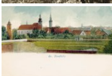
• Stare zdjęcia