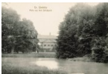
• Stare zdjęcia