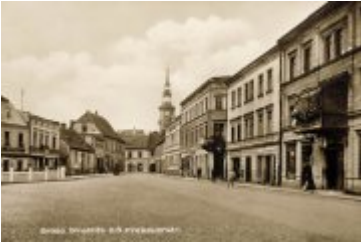
• Stare fotografie