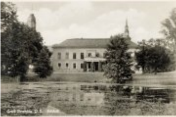
• Stare fotografie