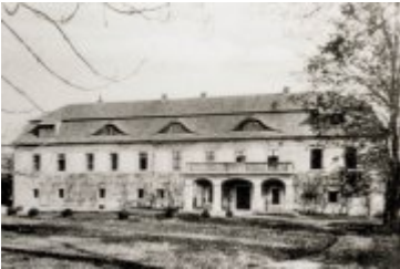
• Stare fotografie