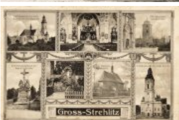
• Stare fotografie