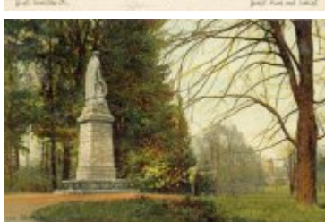
• Stare zdjęcia