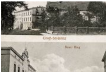
• Stare zdjęcia