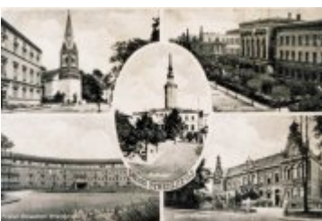
• Stare fotografie