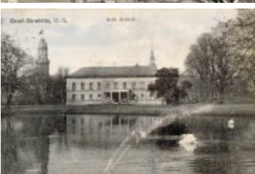
• Stare fotografie