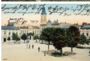
• Stare zdjęcia