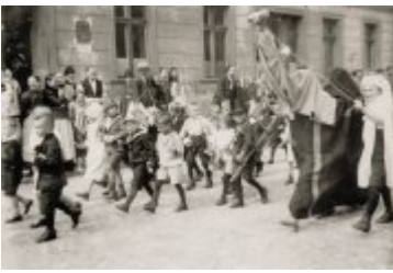
• Stare fotografie