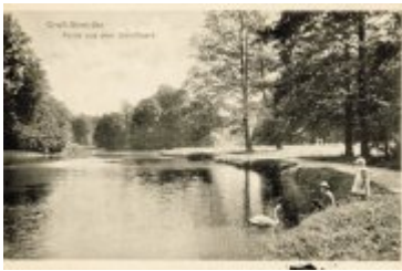
• Stare zdjęcia