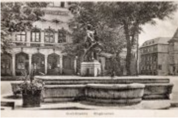
• Stare fotografie