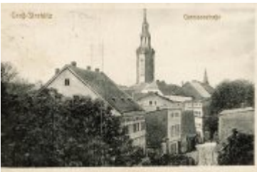
• Stare fotografie