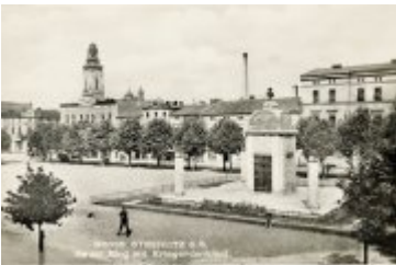
• Stare fotografie