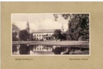
• Stare zdjęcia