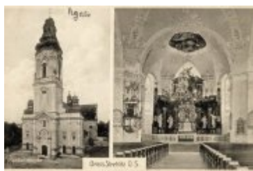
• Stare fotografie