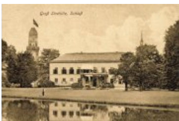
• Stare zdjęcia