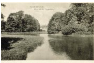
• Stare zdjęcia