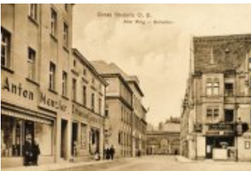
• Stare zdjęcia