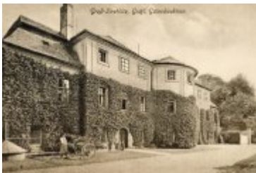
• Stare zdjęcia