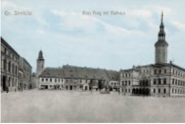
• Stare zdjęcia