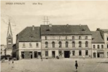
• Stare fotografie