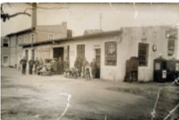
• Stare fotografie