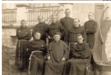
• Stare fotografie