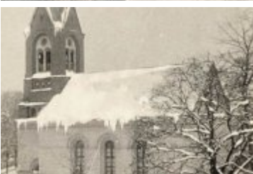
• Stare fotografie