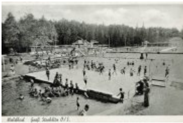
• Stare zdjęcia