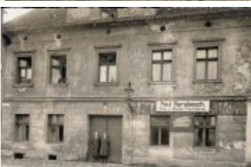
• Stare fotografie