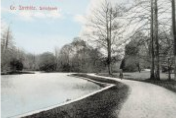
• Stare zdjęcia