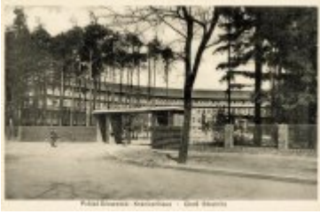
• Stare fotografie