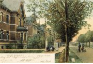
• Stare zdjęcia