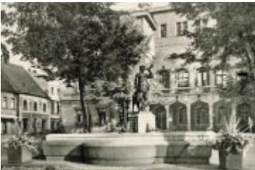
• Stare fotografie