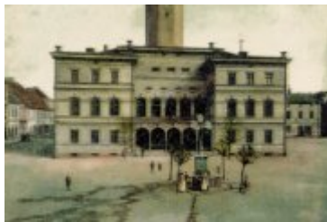
• Stare zdjęcia