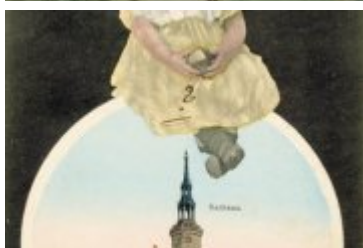
• Stare zdjęcia