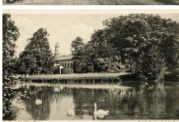
• Stare zdjęcia