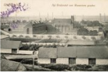
• Stare fotografie