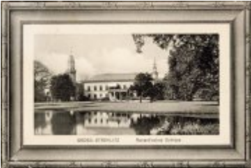
• Stare fotografie