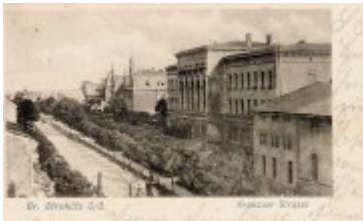
• Stare zdjęcia